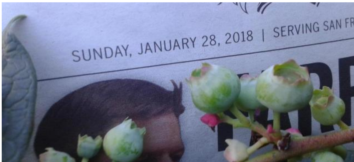
Blueberries in January Northern California

Photosynthesis means ‘synthesis using light’. Photosynthetic organisms use solar energy to synthesize carbon compound that cannot be formed without the input of the energy. QA elements cause more ultra-violet absorption regardless of season changes.