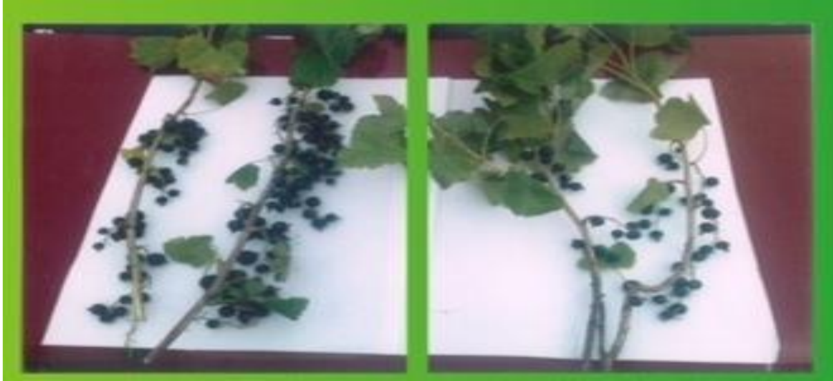
Blueberries with QAGF 300% more production.