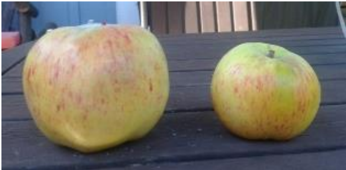
Apple with QAGF